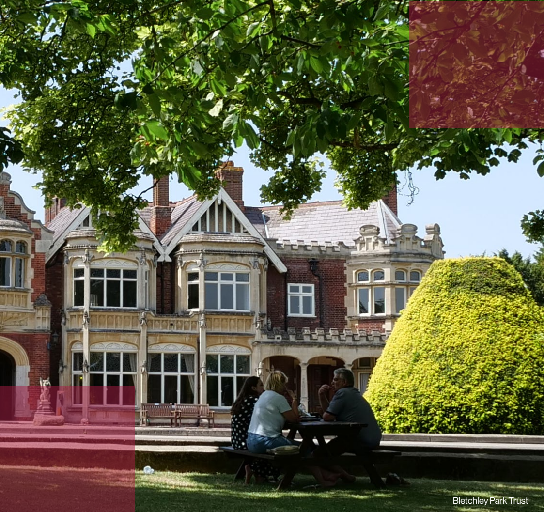
Bletchley Park Trust