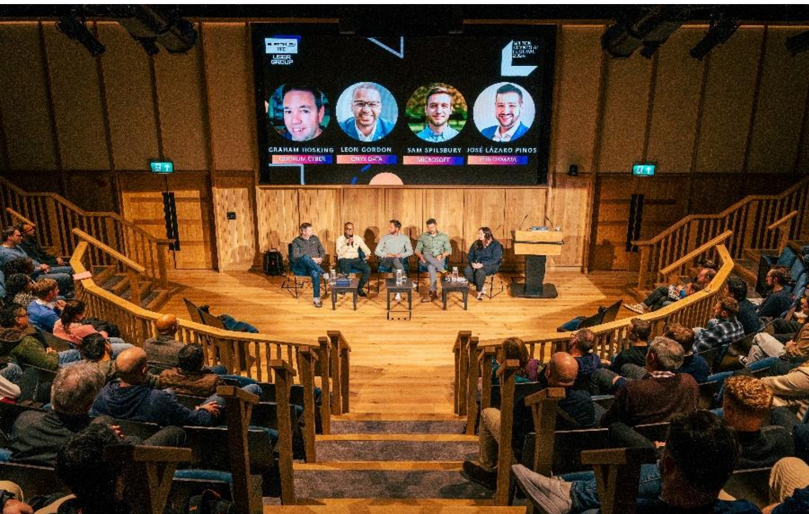
Fellowship Auditorium, above.

The Town Deal project at Bletchley Park, once the communications hub of wartime Bletchley Park, consisted of refurbishing and repurposing Block E to create two new resources.