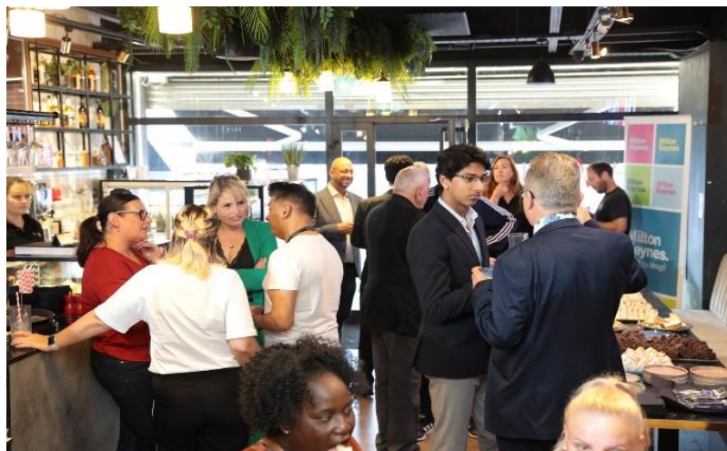
Regular business networking event run by the Town Deal team.

In October 2024, the project launched a grant scheme for business owners and aspiring entrepreneurs in Bletchley and Fenny Stratford. The scheme will provide successful applicants with up to £5,000 to businesses finance commitments such as training, new equipment, branding, marketing, and building maintenance. The outcome of the applications for the grant will be decided in January 2025. The project team continue support business growth in 2025 and are currently designing and creating new initiatives for 2025.