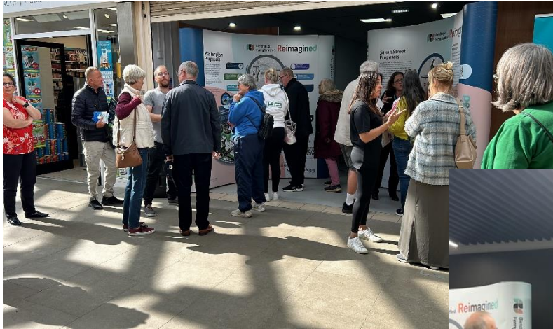
Summer public consultations. Top left: Brunel Centre. Bottom right: MK College.

In summer 2024 we presented our current thinking at a series of public consultations, and used the online platform, Commonplace. We obtained valuable feedback on our conceptual plans. Overall, the plans were well received and supported. The team is using the feedback to further inform the detailed design work – which is currently underway.