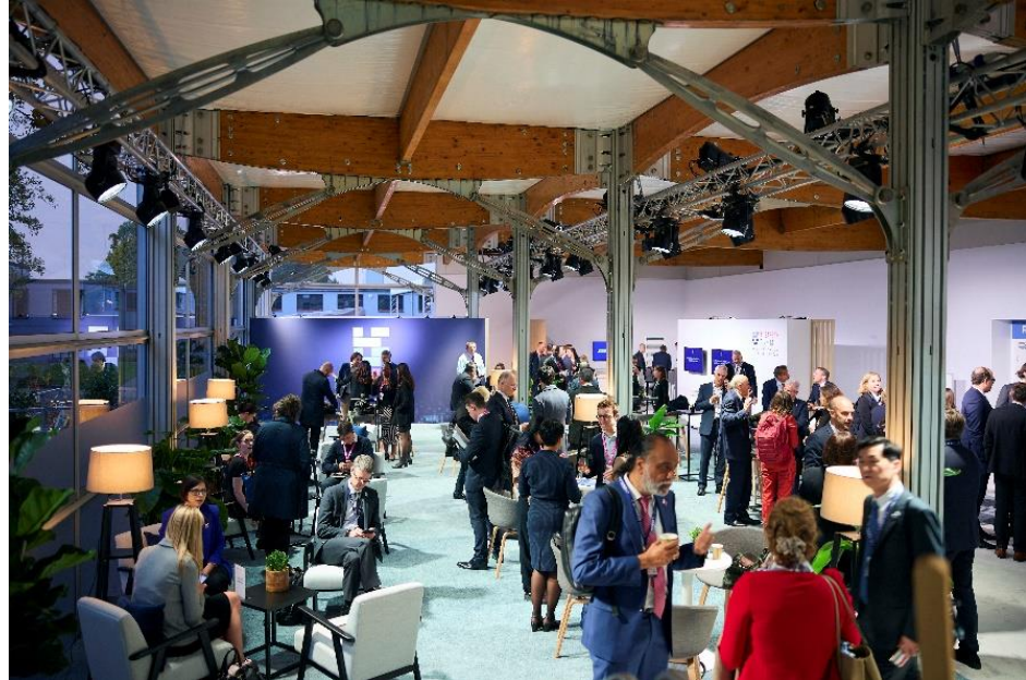
Radley Room, event space above.

Bletchley Park continues to be at the heart of Bletchley's heritage and identity, and we look forward to working closely with the Trust to continue the promotion of the historical site and increase visitor numbers to Bletchley.