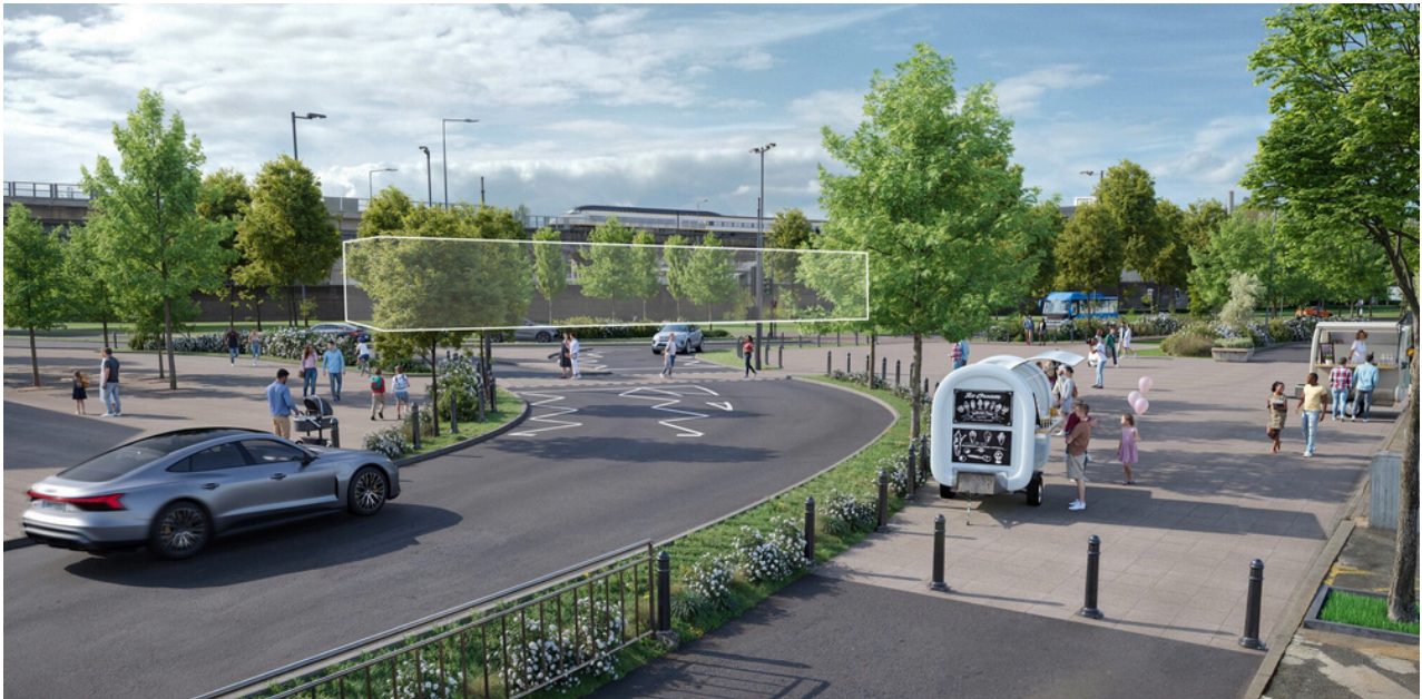
View from the concourse/Locke Road looking towards the station. The proposed location of a potential eastern entrance is indicated by the white outline. Image Dematerial