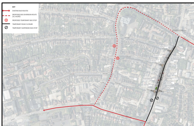
Map showing the temporary traffic diversion route during the Aylesbury Street works.

Town Deal Drop-In Sessions | Groundbreaking Bletchley and Fenny Town Deal or email info@groundbreakingbletchleyandfenny.co.uk