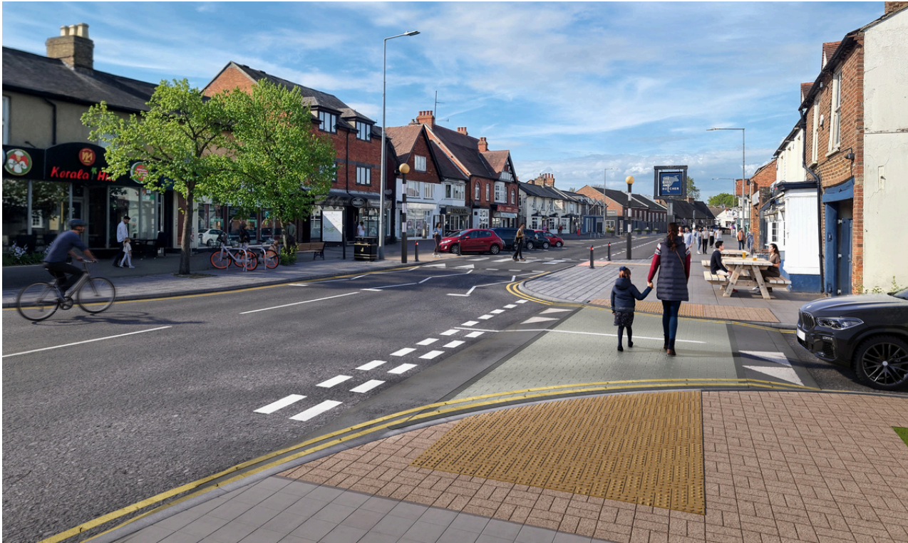
Artist impression showing what the new raised crossings will look like on Aylesbury Street.

The Town Deal team is making good progress on the Aylesbury Street improvement works.