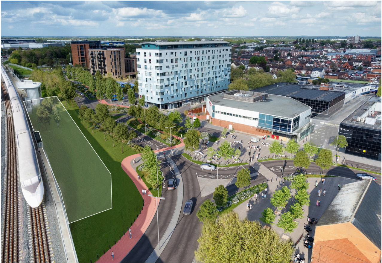
Aerial view of the new layout of Saxon Street. The proposed location of a potential eastern entrance is indicated by the white outline beside the train. Image Dematerial

We'd like to share these images with you so you can see what the benefits of the changes we are making to Saxon Street might look like.