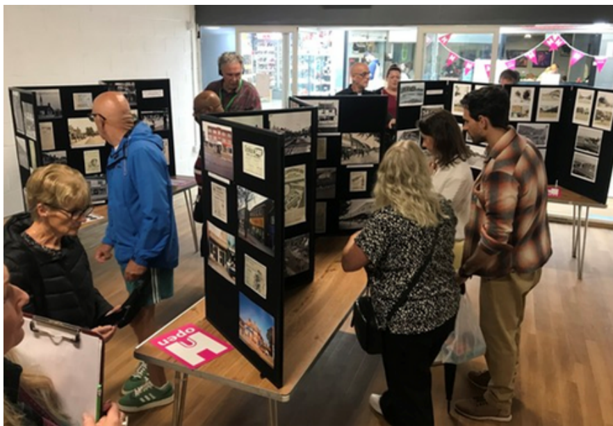
Left, Living Archive Down Memory Lane exhibition, in the Brunel Centre.

info@groundbreakingbletchleyandfenny.co.uk